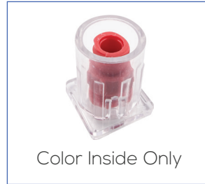
Color Inside Only