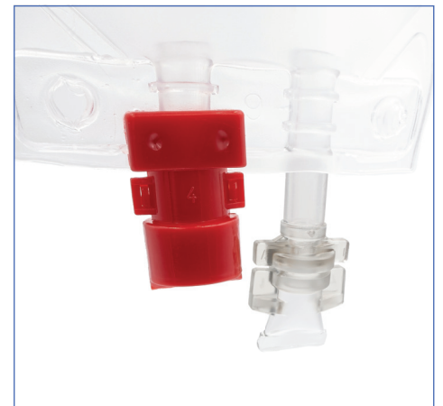
HCT50-MXR Red Shown