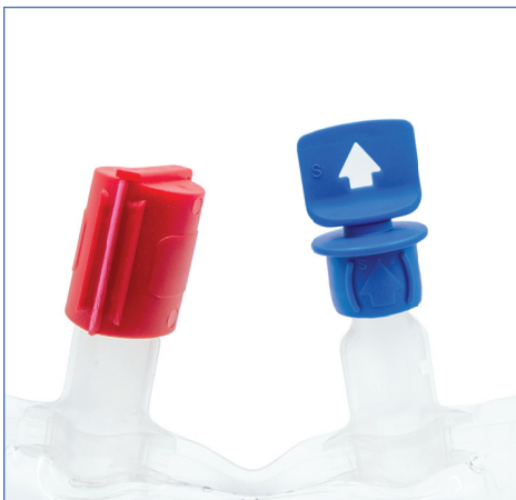
HCT50-HOSXR Red Shown